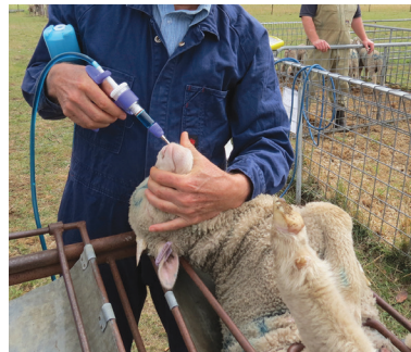
Buccalgesic® being applied to the internal cheek of a lamb.