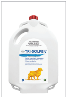
Tri-Solfen®, a topical local anaesthetic and antiseptic gel spray.

There has been large scale adoption of post-operative pain relief (Tri-Solfen®) during the past 13 years. Newer products Buccalgesic® and Metacam® were released in 2016 and Numnuts® has recently been made available.