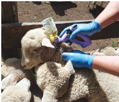
Metacam 20®, a subcutaneous injection high on the neck behind the ear.