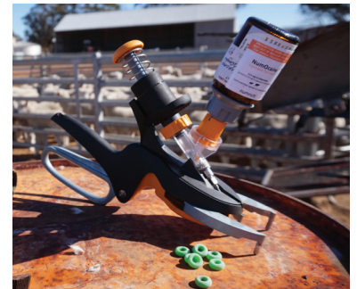
Numnuts® provides pain relief during tail docking and castration.