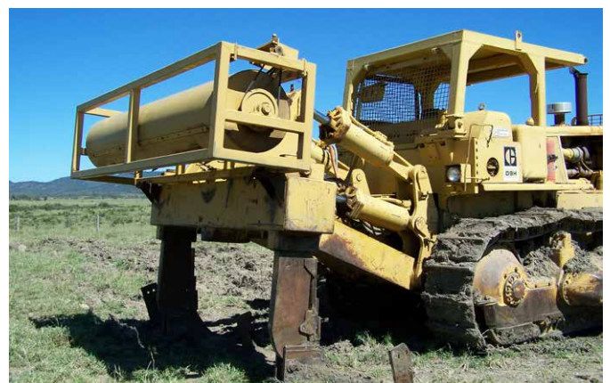
Figure 4: Cutter bar.