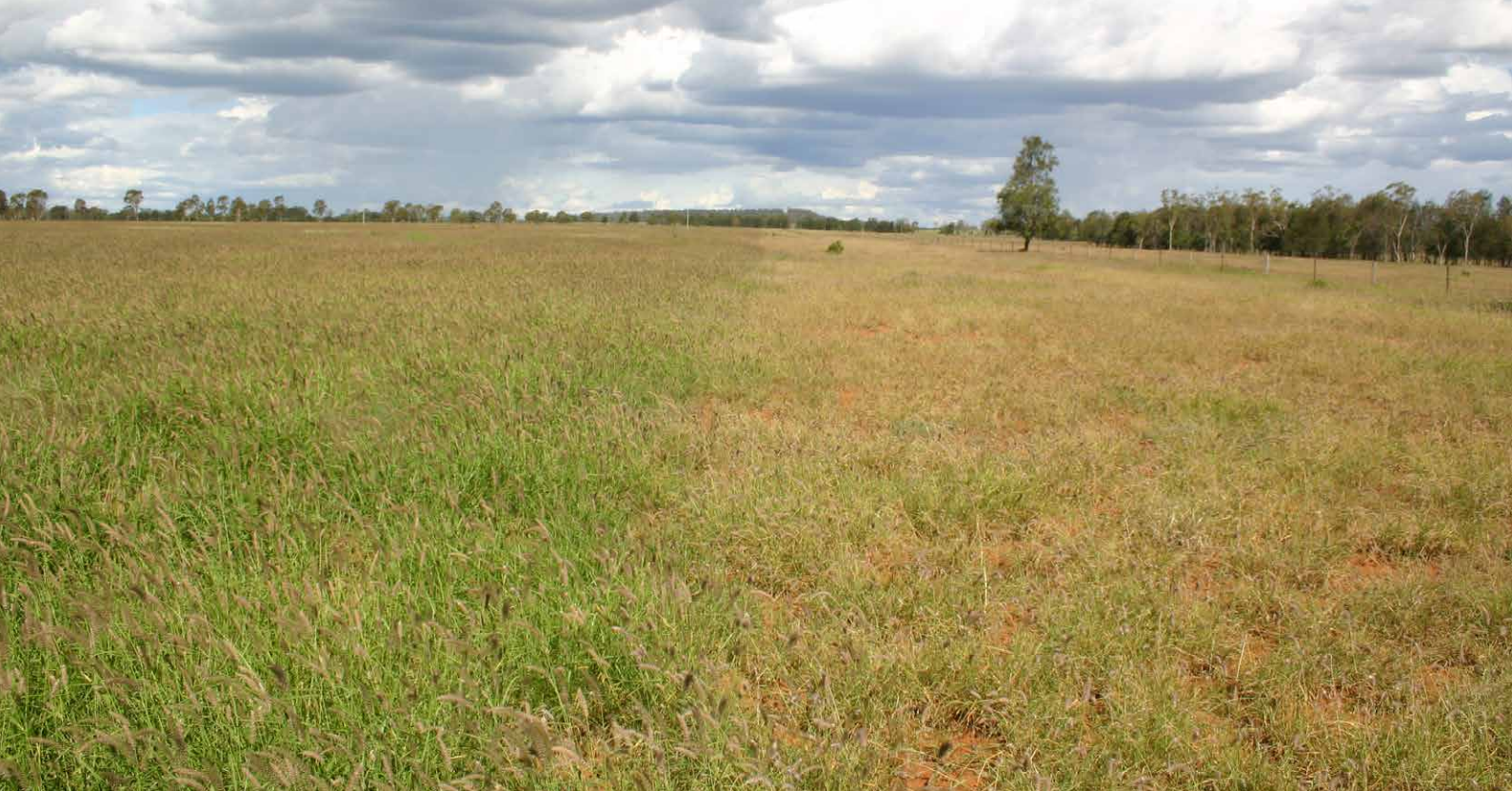
Figure 5: Previously run-down buffel grass on the left has been rejuvenated with the use of a chisel plough.