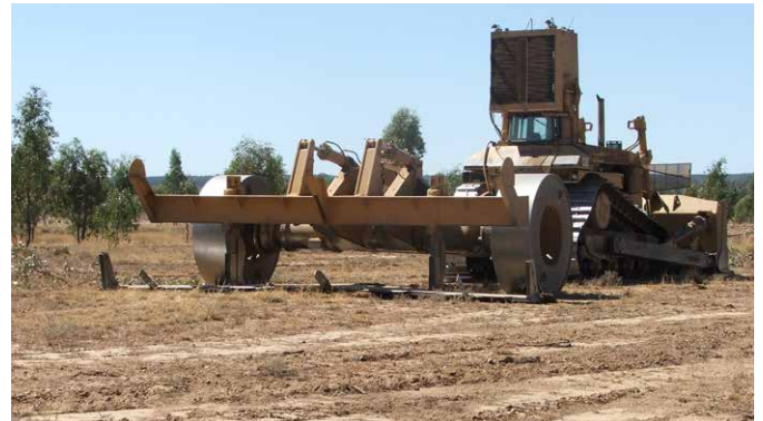
Figure 3: Blade ploughs (above) and cutter bars (below) are often used for controlling regrowth and improving infiltration but are not reliable options for sowing pastures.